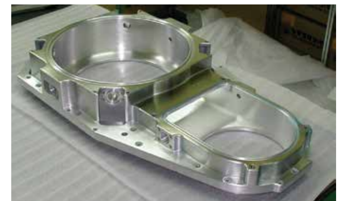
M82 Precision Plate