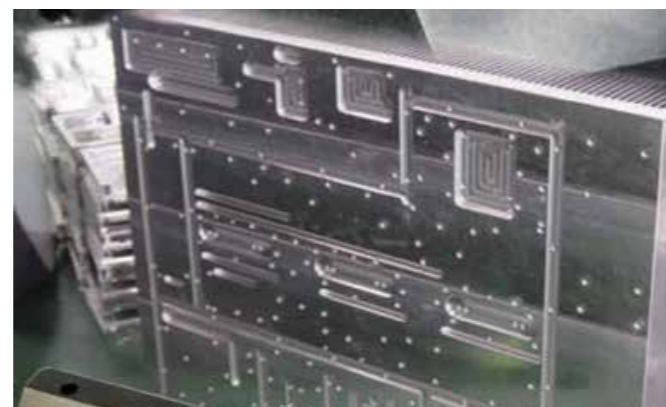
M82 Precision Plate