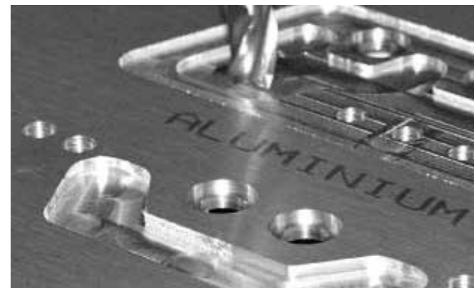
M82 Precision Plate